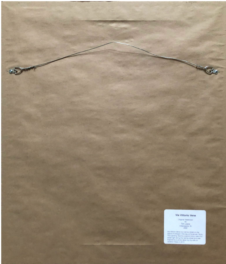
Top of Painting

Some have two mounting holes. One hanger must be attached to the back side of each vertical frame piece, located as shown. The hanging wire between the two hangers is optional for our show.